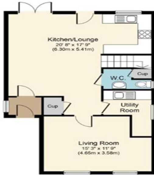
Ground Floor Approximate Floor Area 631 sq. ft. (58.6 sq. m.)