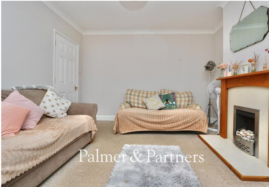
Palmer & Partners