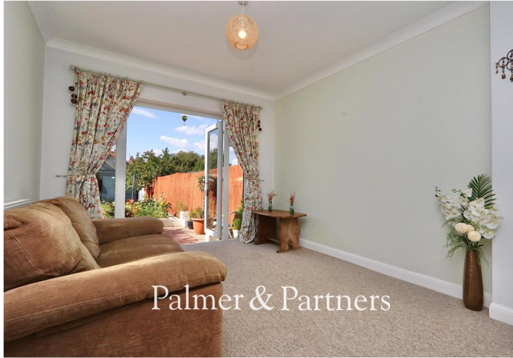
Palmer & Partners