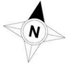
EPC - FLAT 1