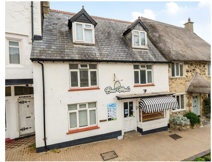
EPC - FLAT 2