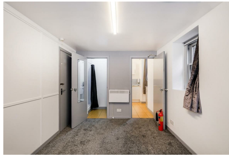
GROUND FLOOR 165 sq.ft. (15.4 sq.m.) approx.