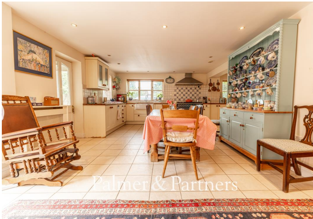
Palmer & Partners