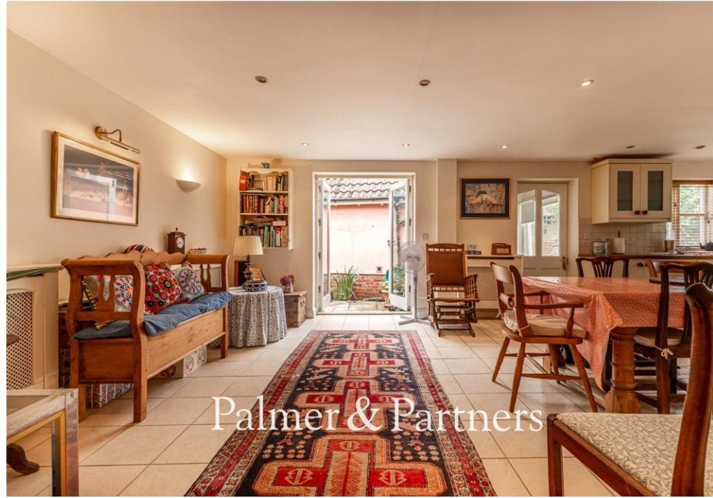
Palmer & Partners