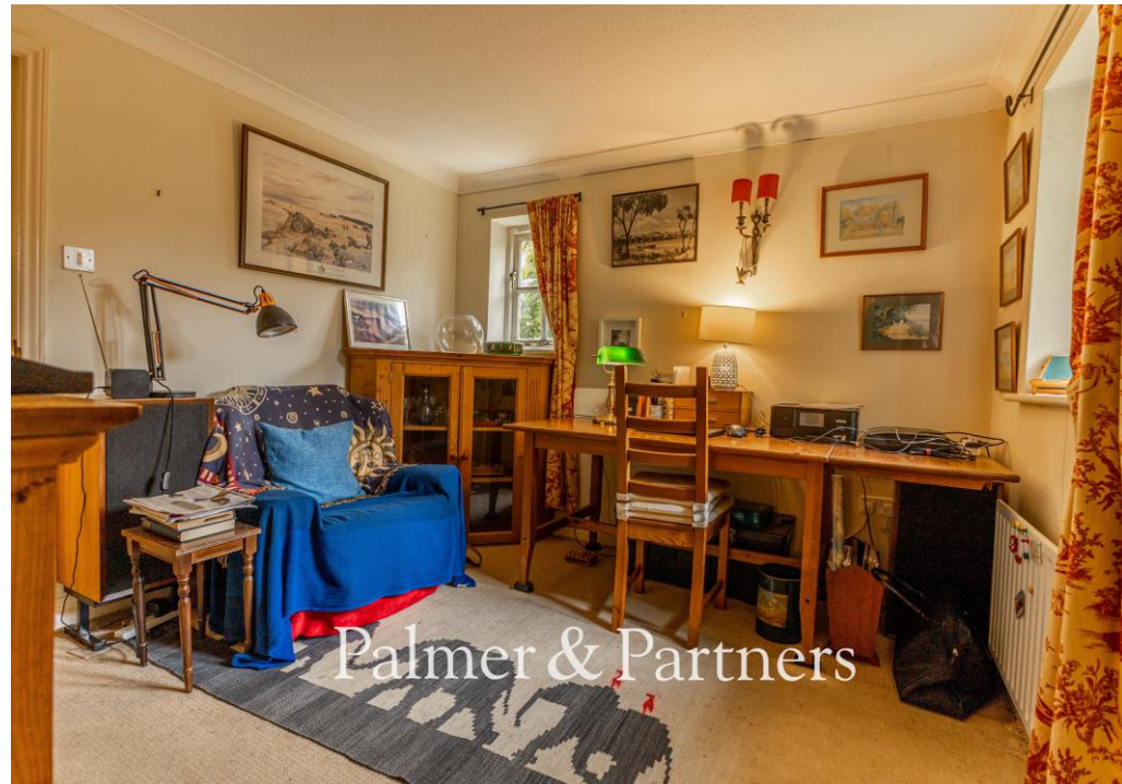
Palmer & Partners