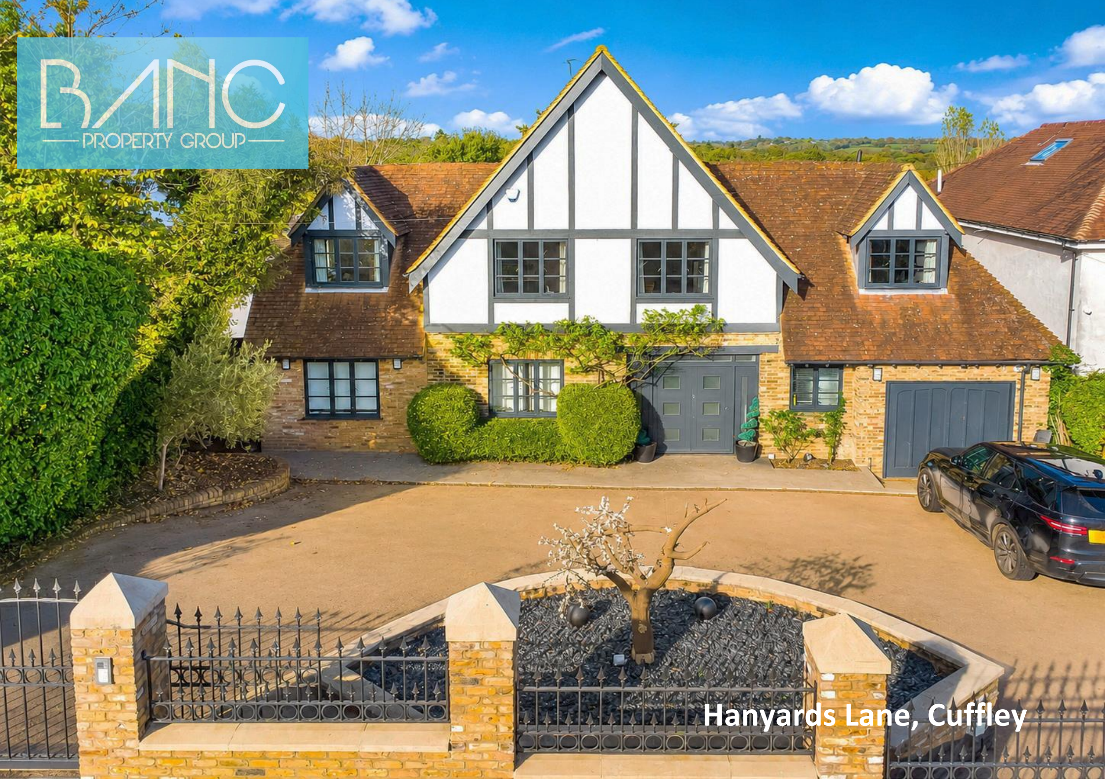
Hanyards Lane, Cuffley