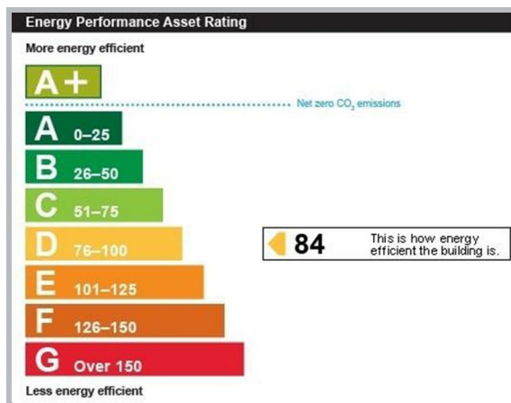
6 Higher Fore Street