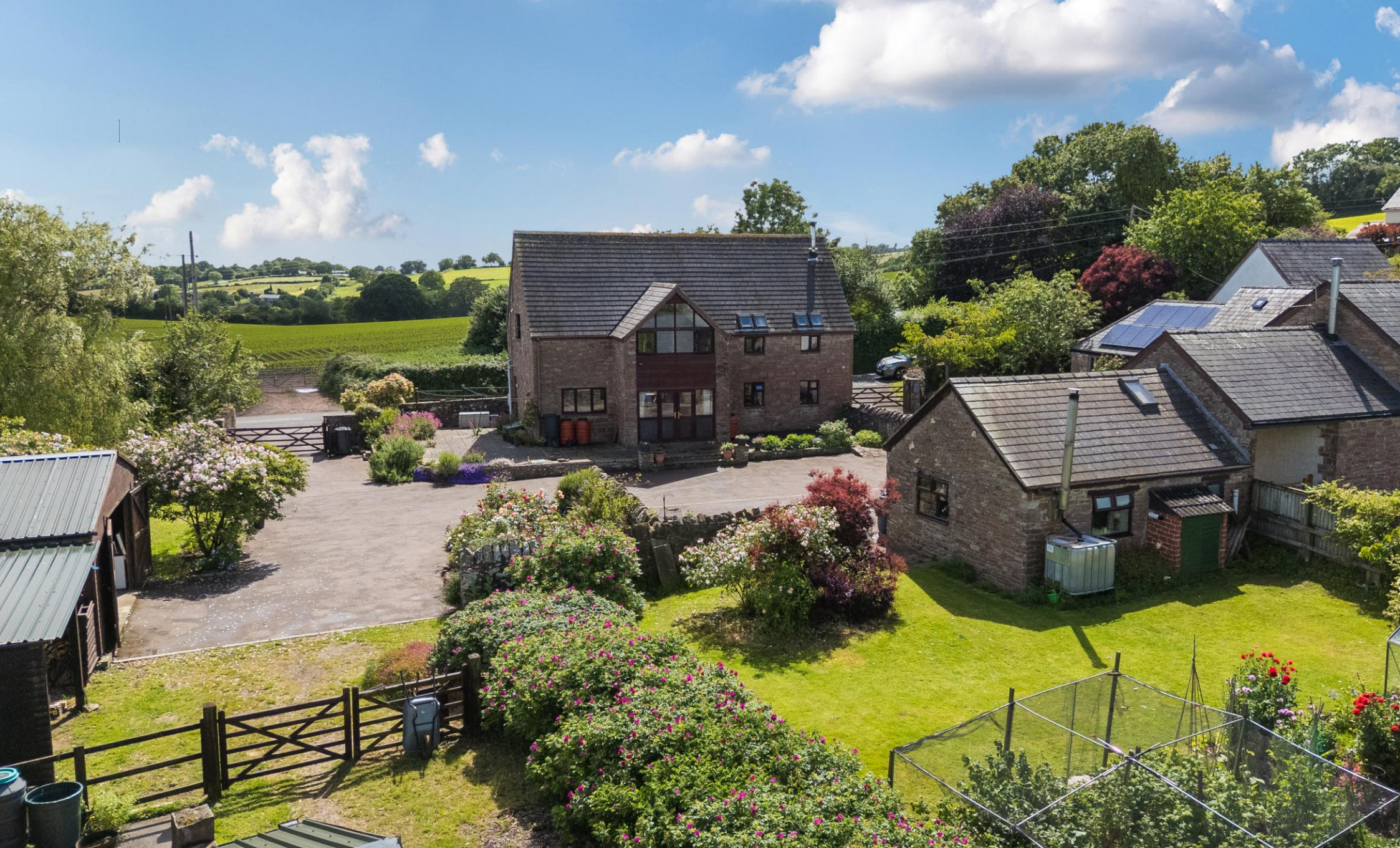
Kites Barn, Viney Hill Lydney, Gloucestershire, GL15 4LT