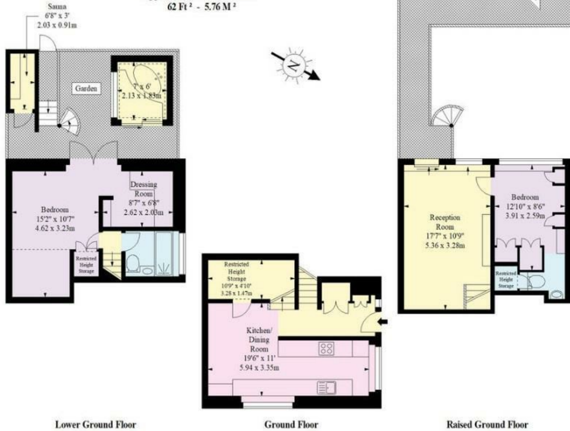
Illustration For Identification Purposes Only. Not To Scale

Spedan Close, NW3 Approx. Gross Internal Area * 894 Ft 2 - 83.05 M 2 Sauna & Out Building Approx. Gross Internal Area * 62 Ft 2 - 5.76 M 2