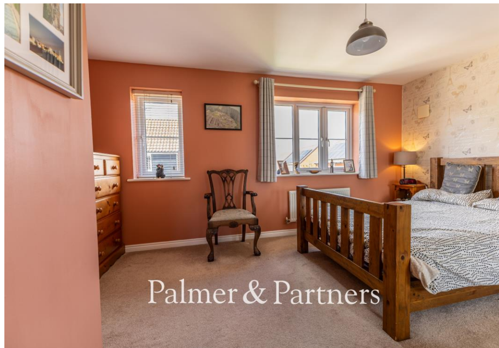
Palmer & Partners