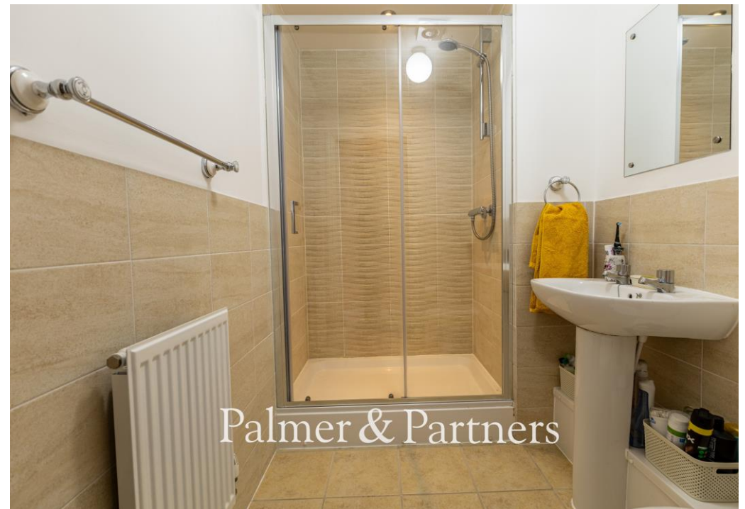
Palmer & Partners