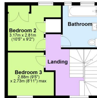
First Floor Approx. 31.3 sq. metres (336.8 sq. feet)