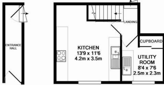
GROUND FLOOR APPROX. FLOOR AREA 46 SQ.FT. (4.3 SQ.M.)