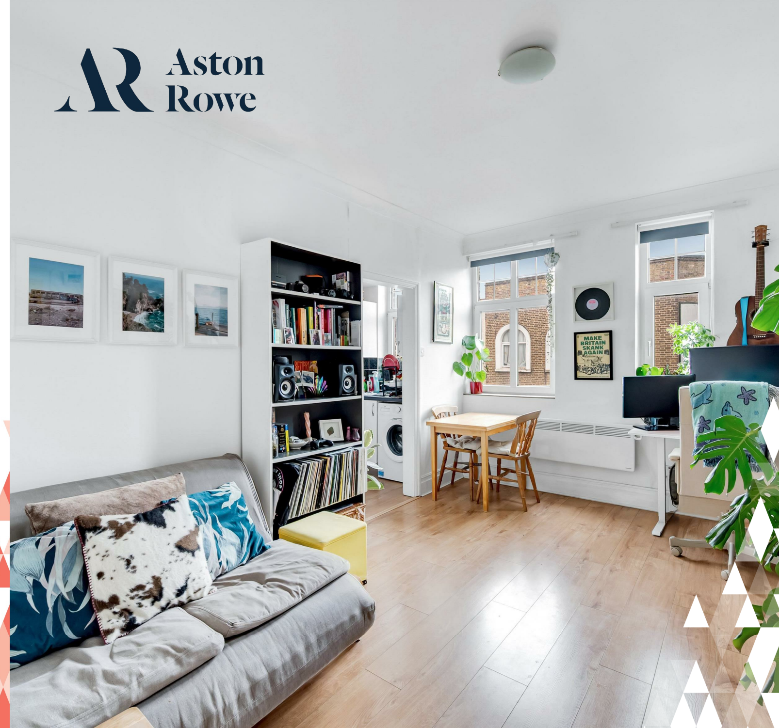
Churchfield Road Approximate Gross Internal Area = 43.4 sq m / 467 sq ft