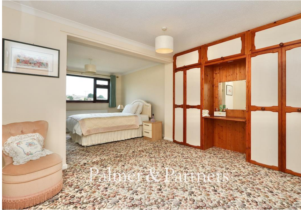
Palmer & Partners