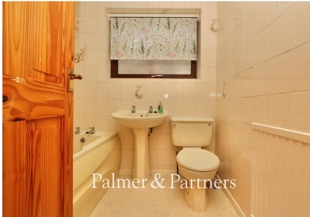
Palmer & Partners