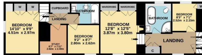
GROUND FLOOR 906 sq.ft. (84.1 sq.m.) approx.