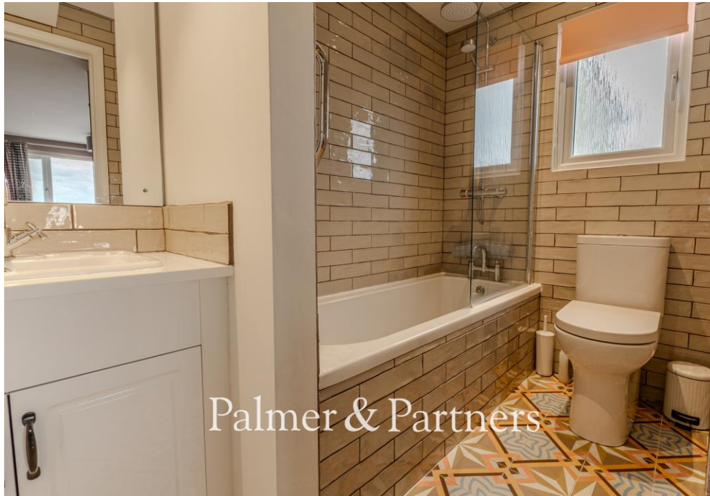
Palmer & Partners