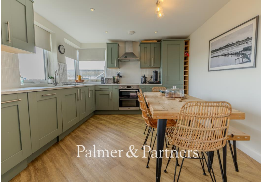
Palmer & Partners