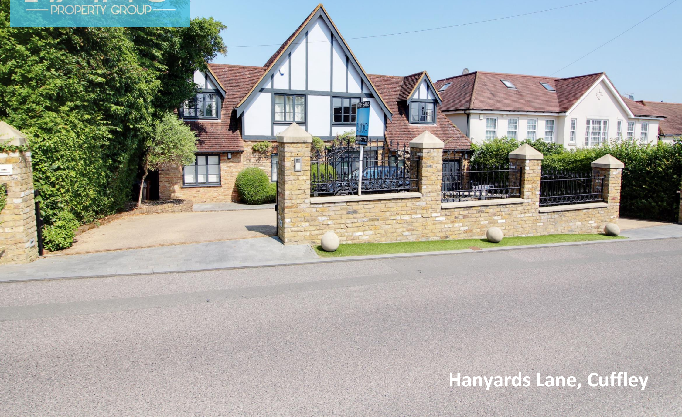
Hanyards Lane, Cuffley