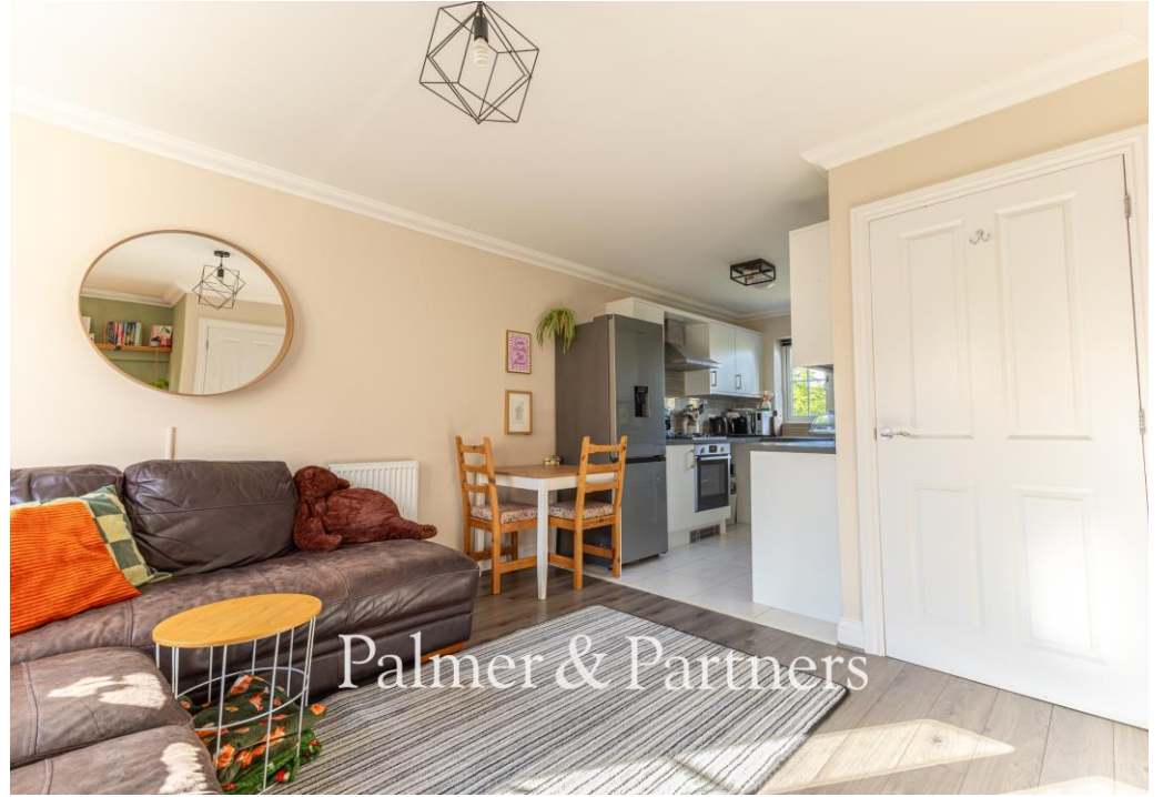
Palmer & Partners