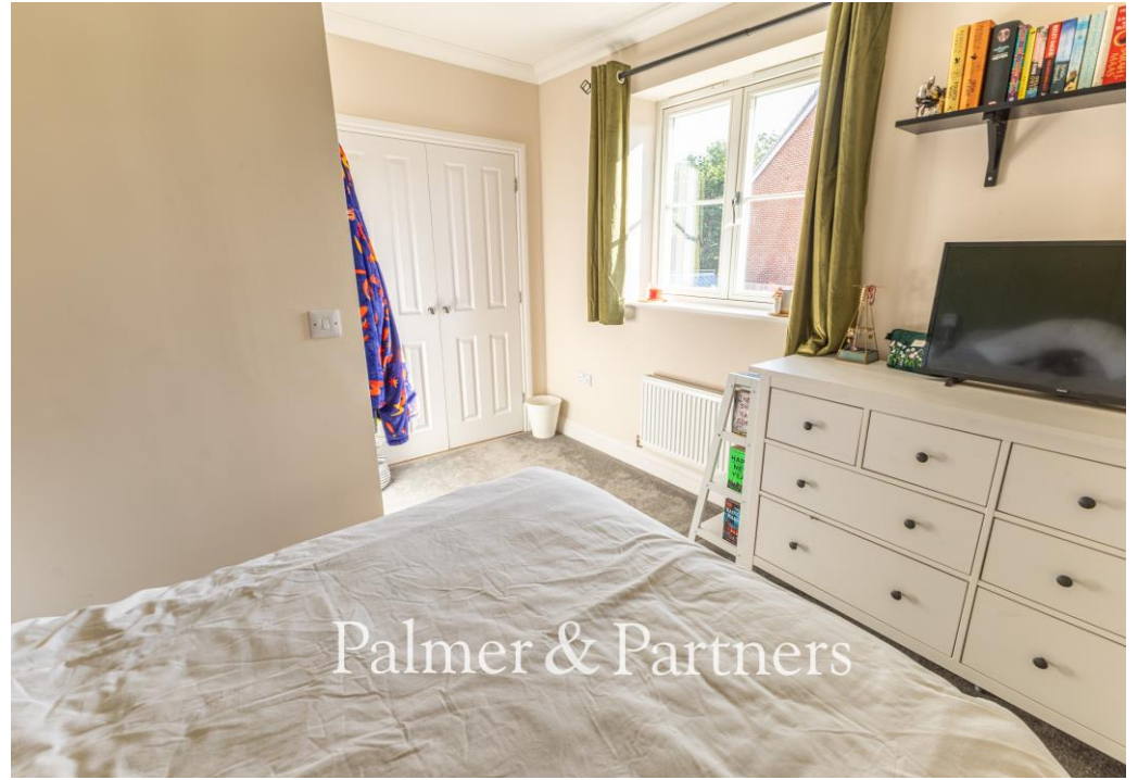
Palmer & Partners