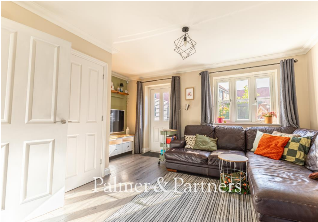
Palmer & Partners