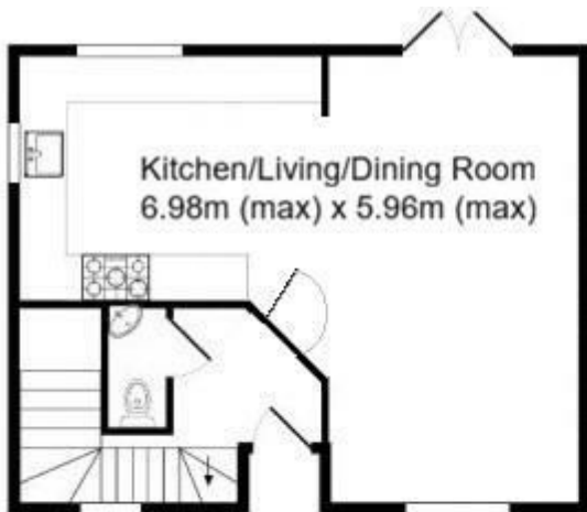
GROUND FLOOR APPROX. FLOOR AREA 464 SQ. FT. (43.1 SQ. M.)