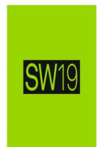
ILLUSTRATION FOR IDENTIFICATION PURPOSES ONLY

ALL MEASUREMENTS ARE MAXIMUM, AND INCLUDE WINDOW BAYS AND WARDROBES WHERE APPLICABLE THIS PLAN MUST NOT BE REPRODUCED BY ANY OTHER PERSON WITHOUT PERMISSION