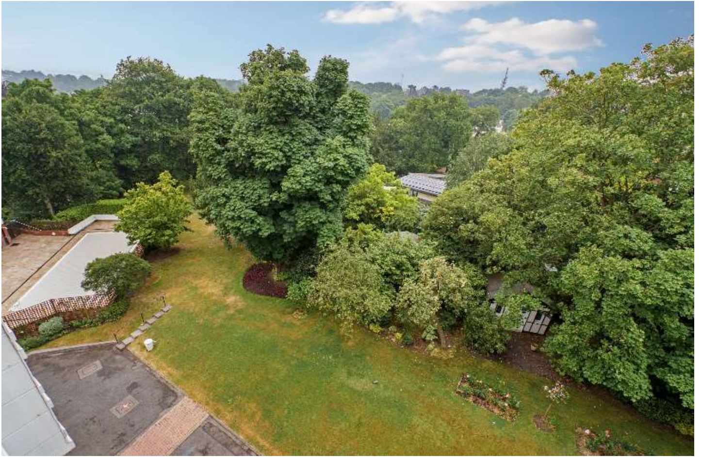
View from Flat