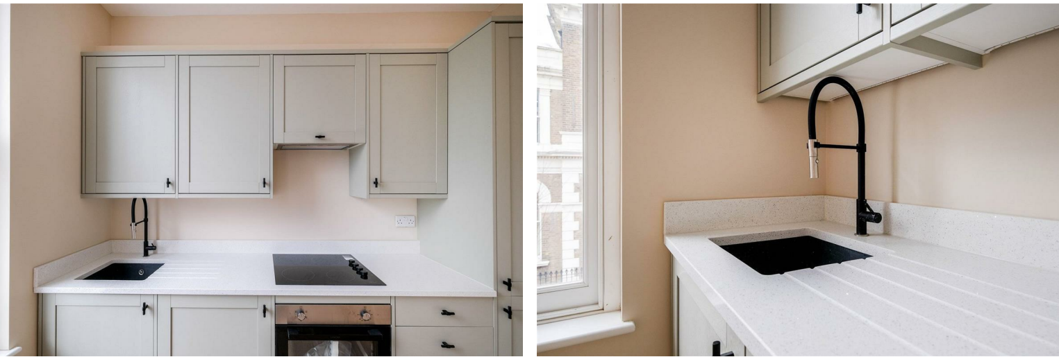
FIRST FLOOR 347 sq.ft. (32.3 sq.m.) approx.