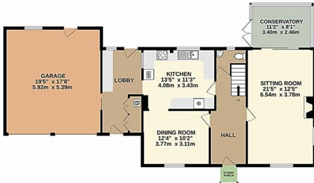
GROUND FLOOR 876 sq.ft. (81.4 sq.m.) approx.