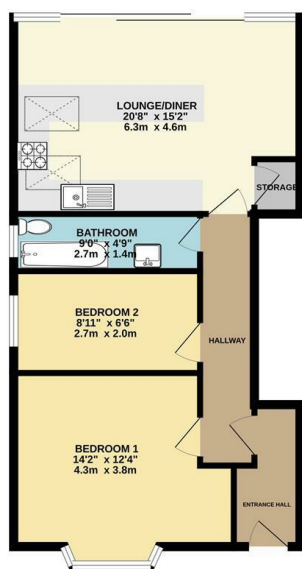
TOTAL FLOOR AREA: 597 sq.ft. (55.5 sq.m.) approx. While every effort has been made to ensure the accuracy of the floorplan, the measurements of doors, windows, stairs and any other items are approximate and no responsibility is taken for any error, omission or misstatement. This plan is for illustrative purposes only and should not be used as a guide to the actual property. The agent, agent and advertiser make no representation and no guarantee as to their accuracy or efficiency can be given. Map data © OpenStreetMap contributors, Imagery © Mapbox

Council: Waltham Forest | Council Tax Band: B | Floor Area: 597.00 sq ft