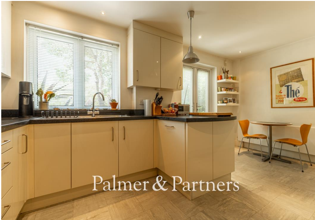
Palmer & Partners