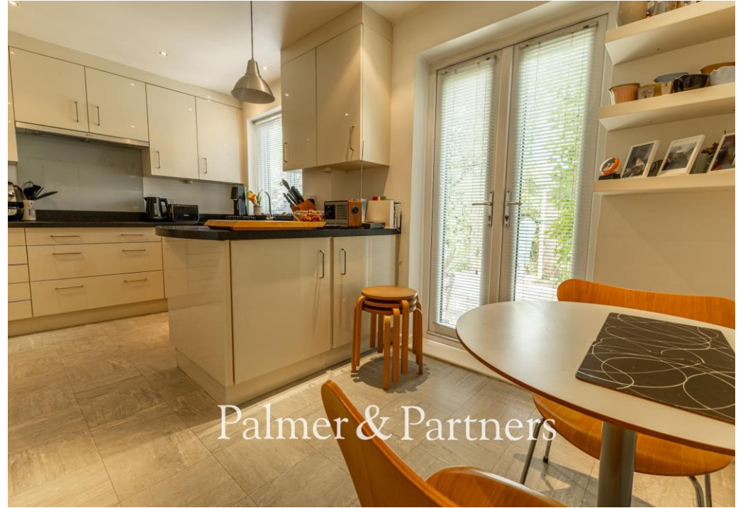
Palmer & Partners