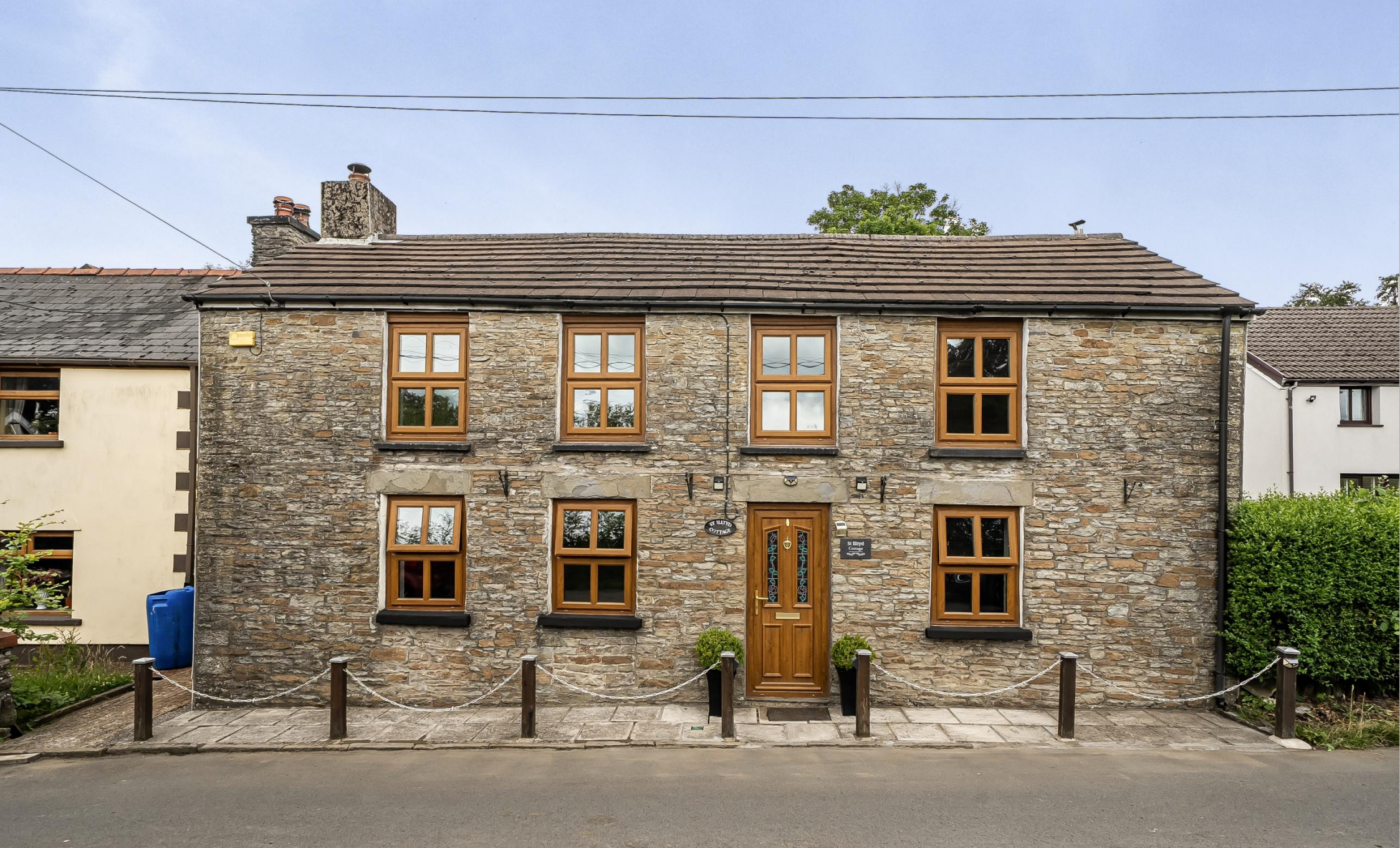
St. Illtyd Cottage Aberbeeg, Abertillery, NP13 2AY