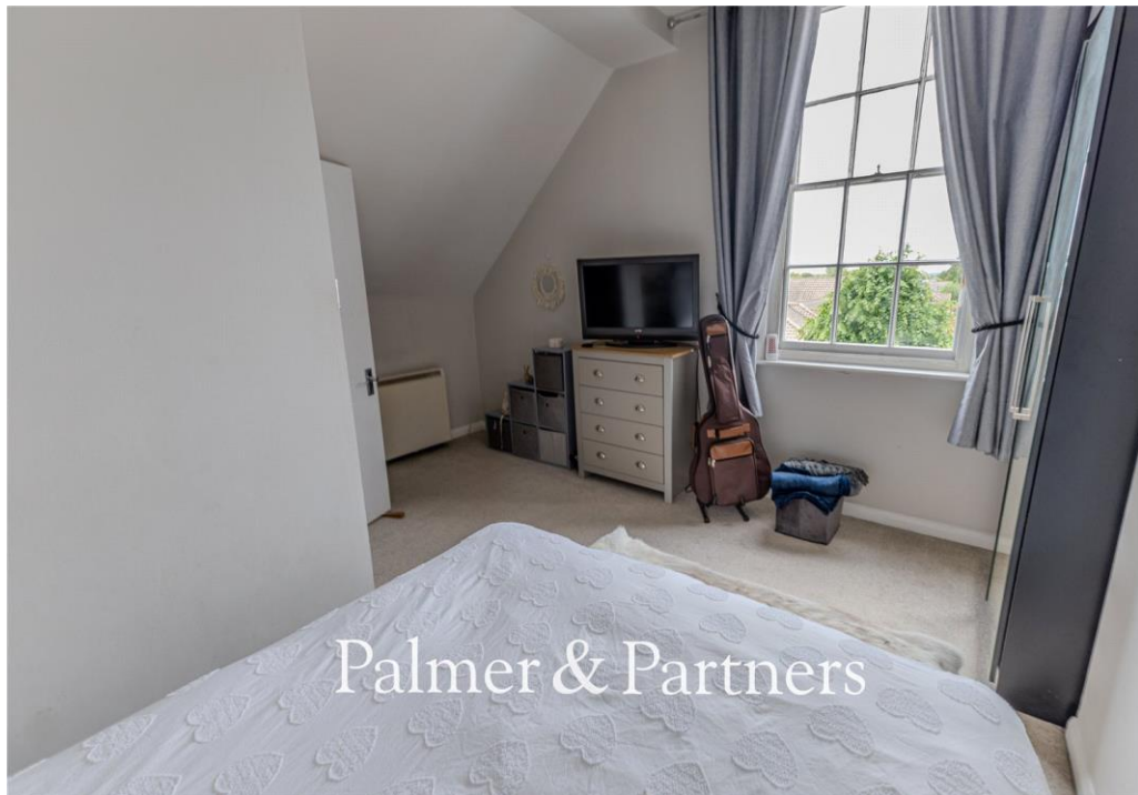
Palmer & Partners