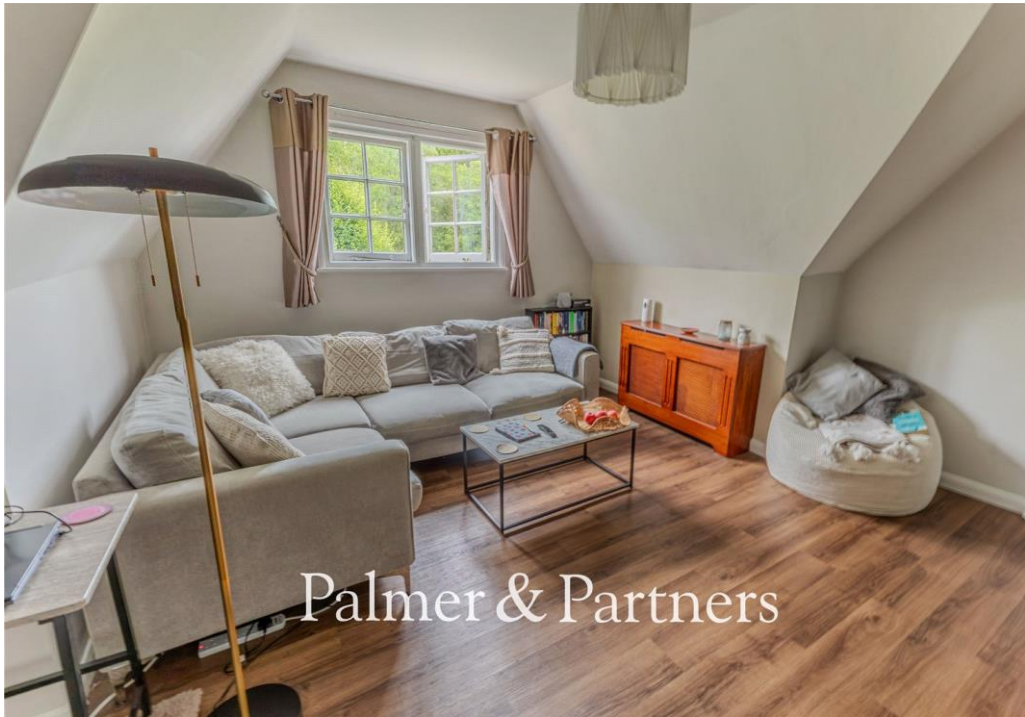
Palmer & Partners