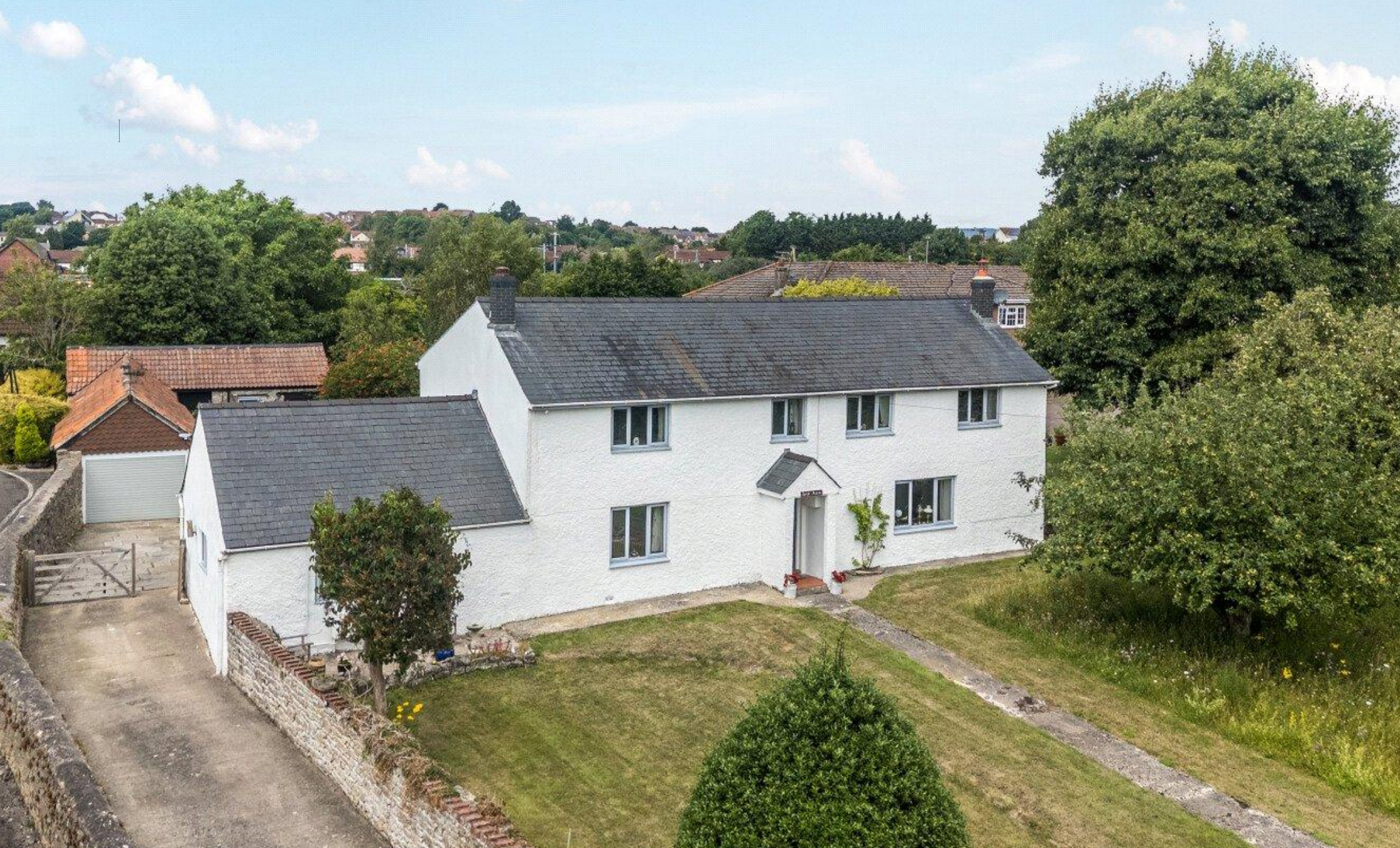
Arch Farm, Undy Monmouthshire, NP26 3EN