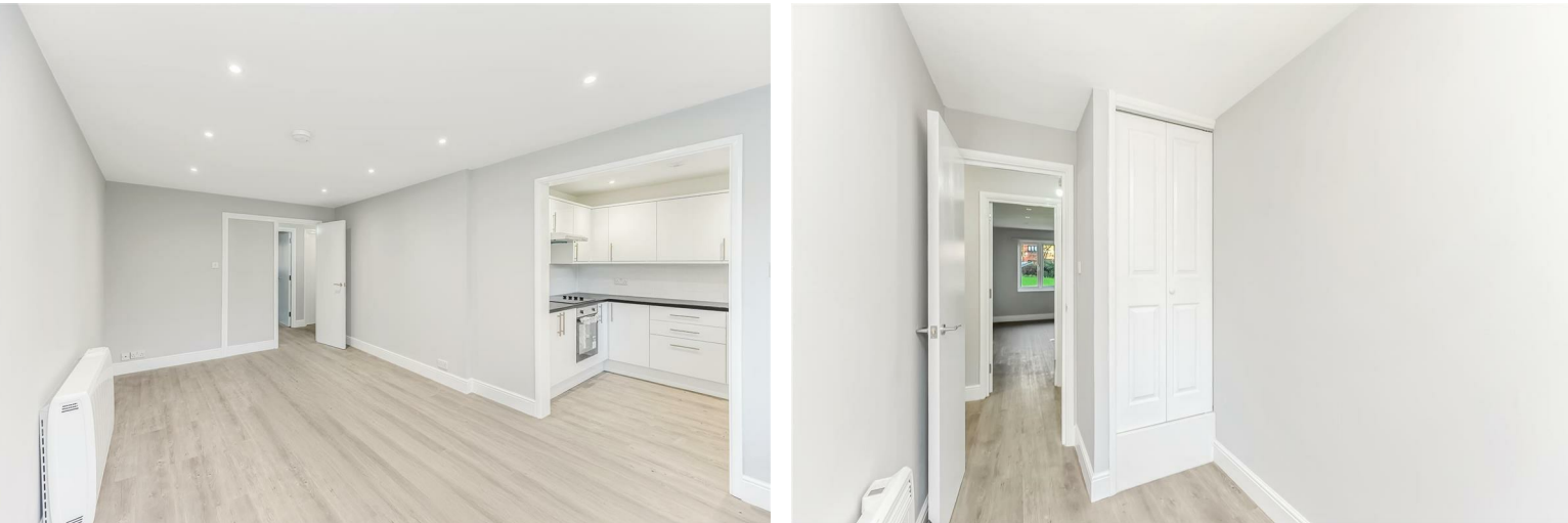
GROUND FLOOR 536 sq.ft. (49.8 sq.m.) approx.