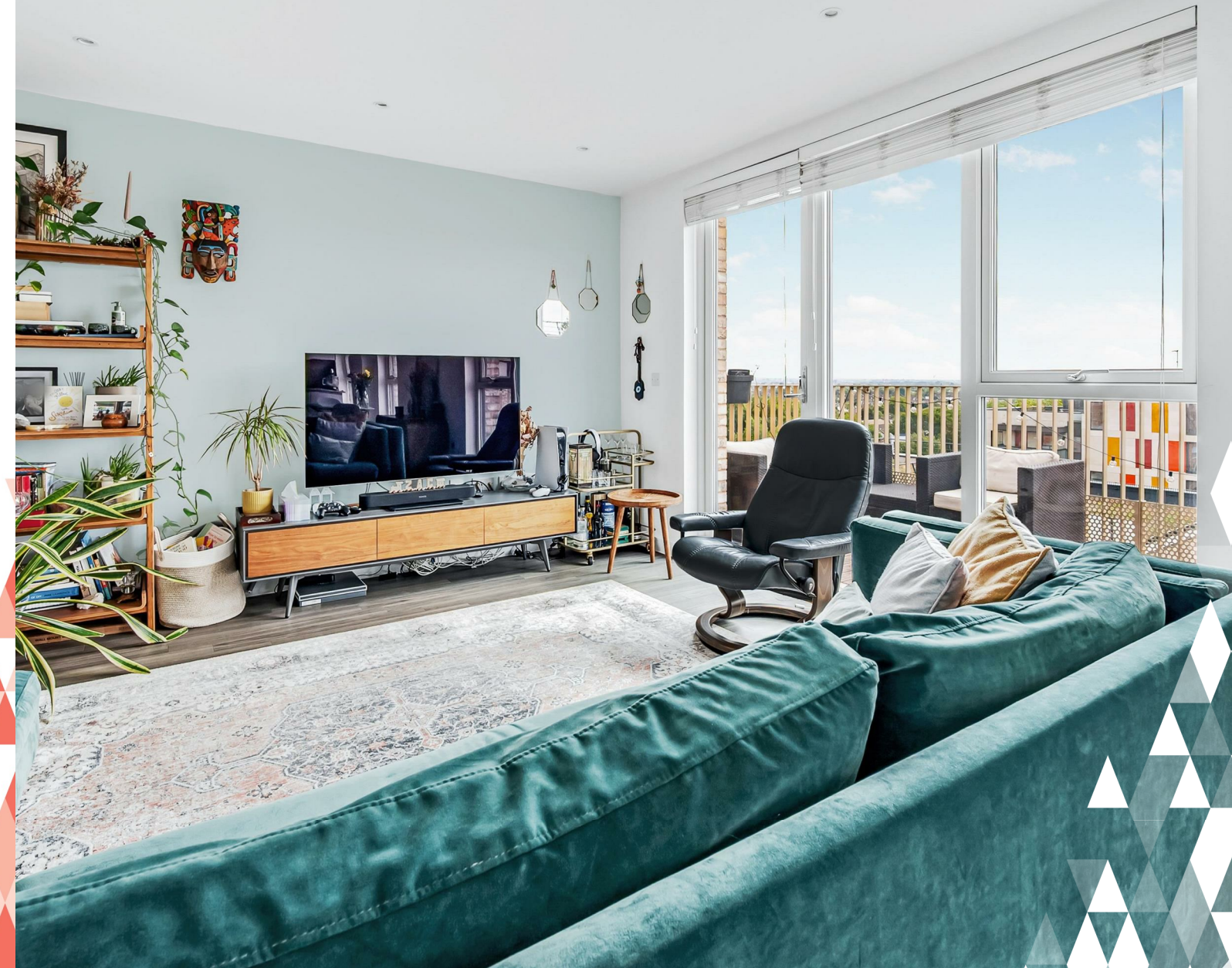
Munster Court Approximate Gross Internal Area = 80.1 sq m / 862 sq ft