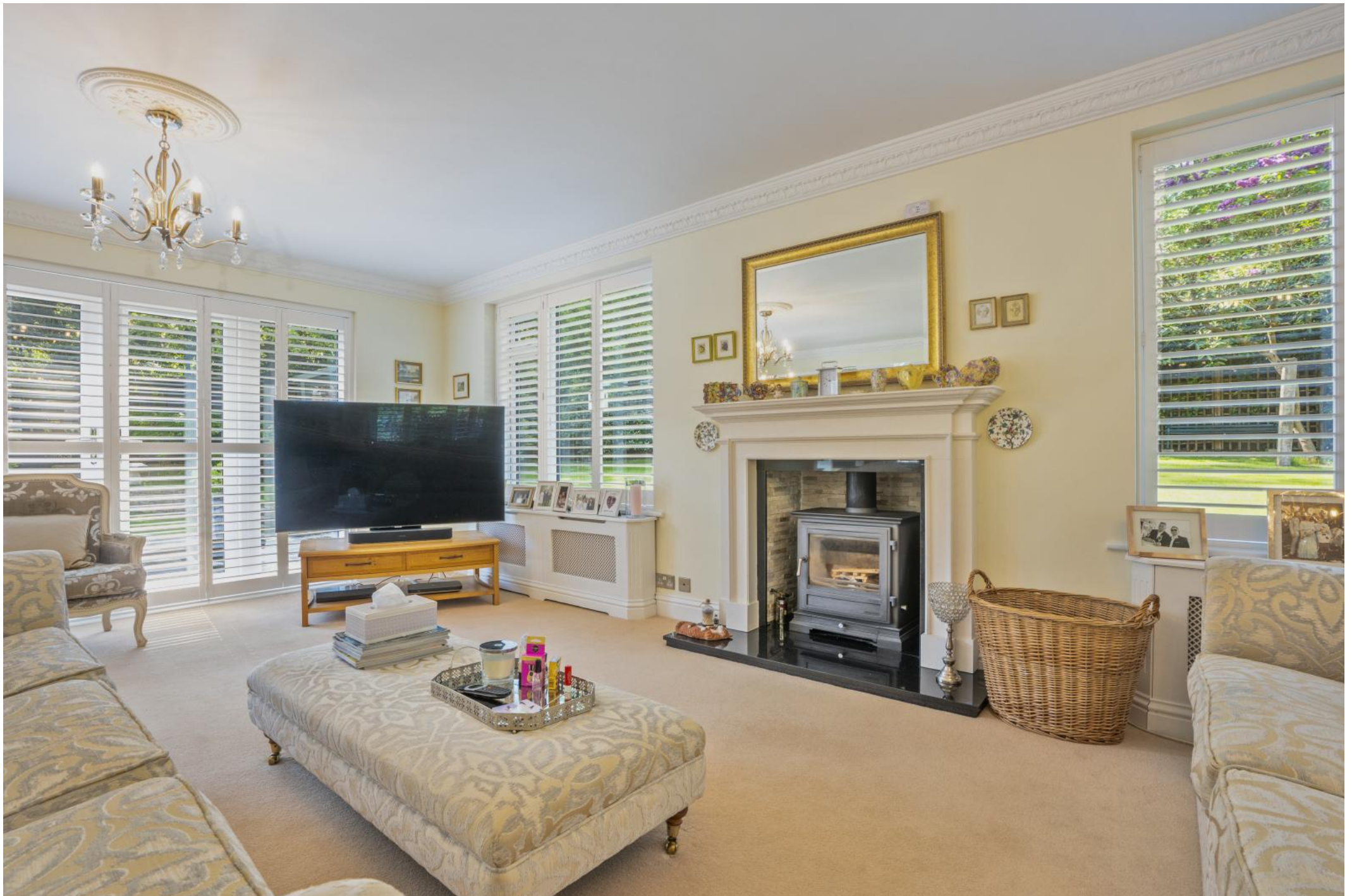
19 ASHLEY DRIVE NORTH | 2 | ASHLEY HEATH