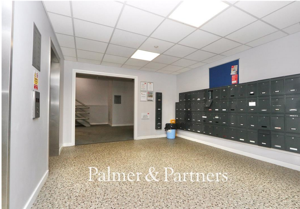
Palmer & Partners