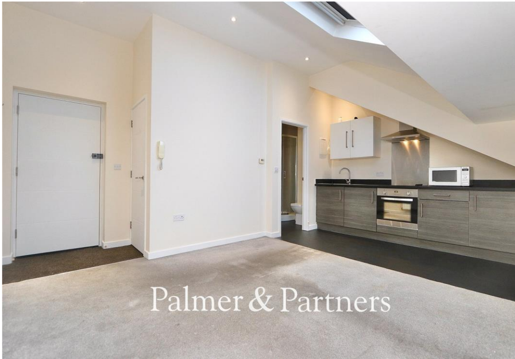
Palmer & Partners